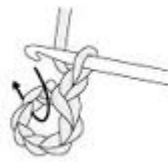
Diagram of slip stitch (sl st) to join ring.

Chain 3, join with slip stitch (sl st) to form a ring. 5 Single crochet (sc) in ring.