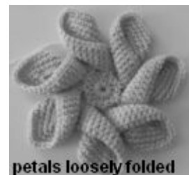
Crochet flower hot pad petals loosely folded.