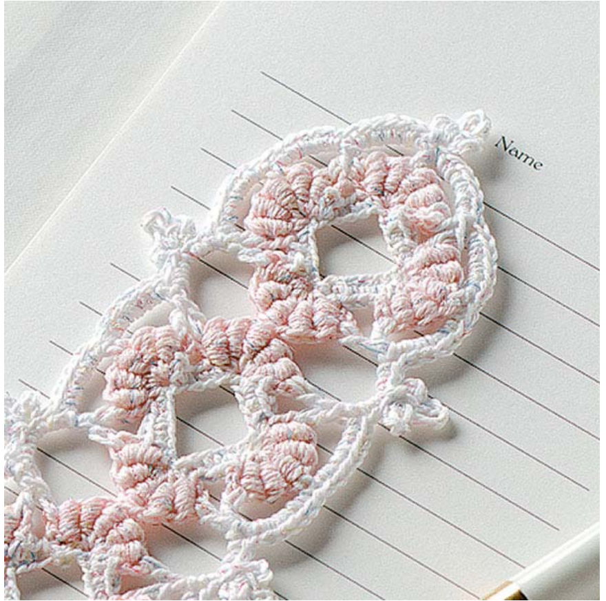
Color change in chain

With white, ch 24, sl st in first ch to form ring, ch 1, sc in first 5 chs changing to pink in last st made, ch 3, 3 bullion sts in next ch; joining to bottom of last